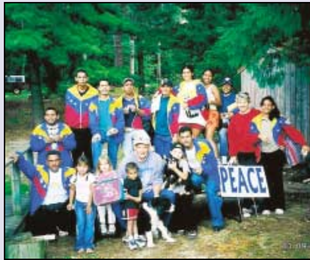
Cultural Awareness tour group from Jesucristo Resucitado Parroquia - our Archdiocesan Mission in Venezuela - found some time in their busy September schedule to relax in northern Minnesota.