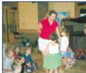
St. Jude of the Lake Vacation Bible School children learned all about the life and culture of our brothers and sisters living in Venezuela.